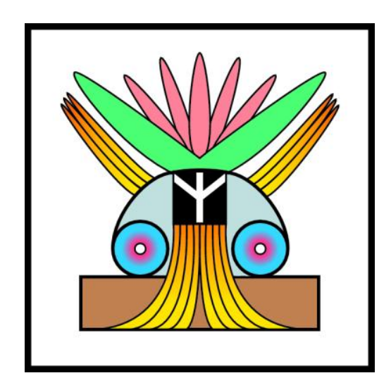
Saalome Pronounced (Sah lo may)